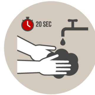
HAND WASH HOURLY