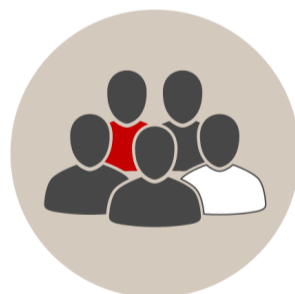
FAMILY MEMBERS: Working in essential services / returning to the country

Stage 4 No access to visitors except for designated persons