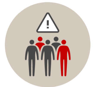
Close Personal Contact (CPC)

Stage 4 Work from home policy except for essential services