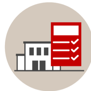
Work Force Location