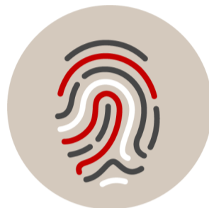
Finger Print Machine